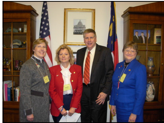
BPW/NC Delegates with Representative Larry Kissell