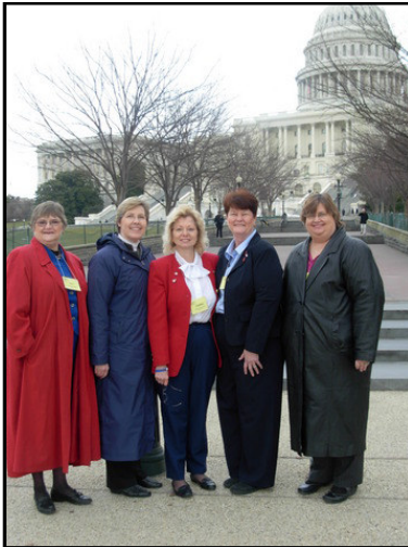
BPW/NC Delegates in Washington, DC, Capitol Building