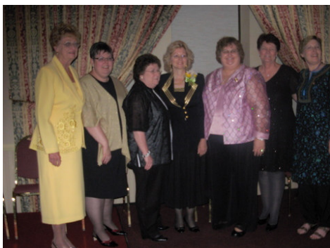
New Officer Installation