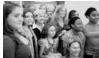
This picture accompanied an article in the Charlotte Observer July 3 rd , 2009