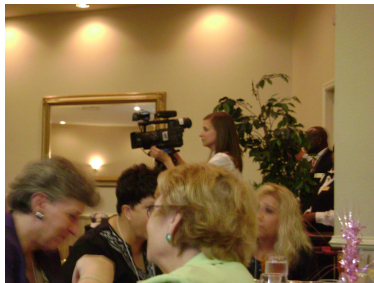
NBC News Crew at 2009 State Conference during the Governor's Speech.

So, I encourage all of you to contact your local news media and let them know about your experience at the State Conference. Submit your own photos and press releases and see if you can get coverage for your Locals. I also encourage you to write to the editors of your newspapers and discuss the issues that are important to you. This is by far the best way to spread the word about BPW.